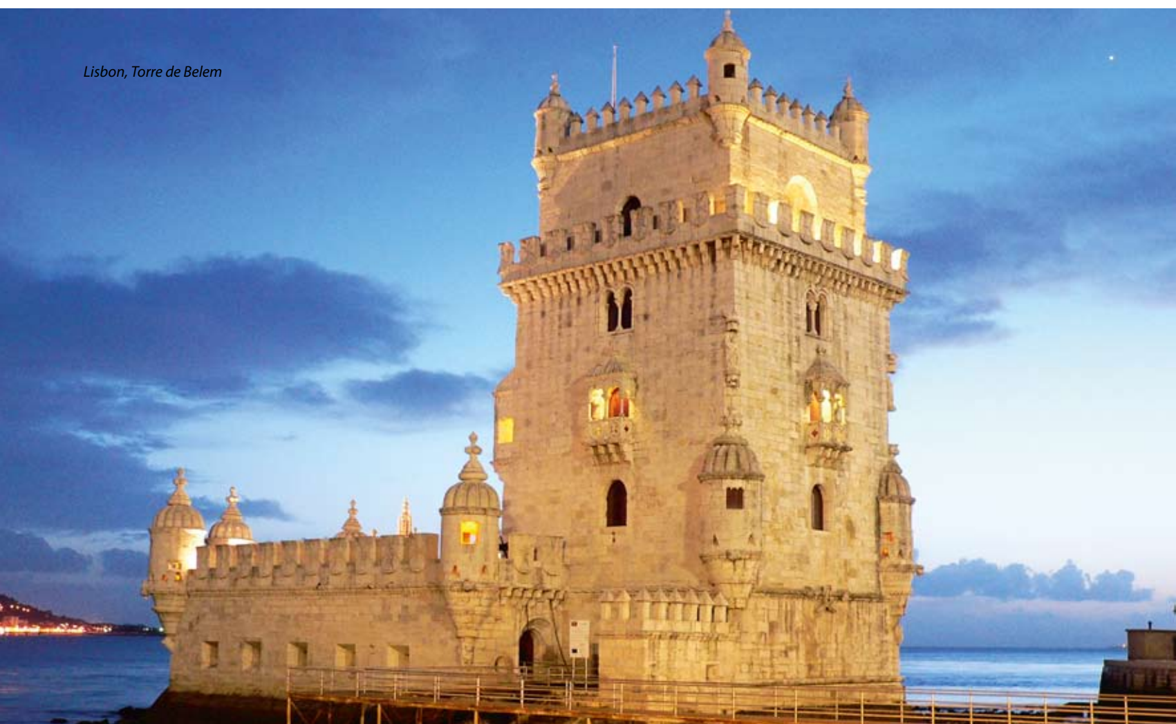
Lisbon, Torre de Belem

Public debt and financial budgetary imbalances are being corrected with a great sense of responsibility and with very firm political commitment. We are very fortunate to have a national political